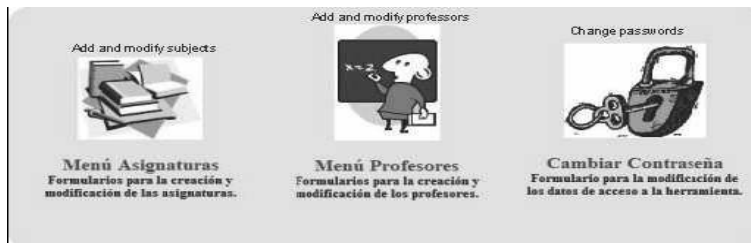
Fig. 2. Main menu of HECACEJ: Subjects, Professors and Passwords.

These drawbacks motivated the development of a Contents Meta-Manager, able to collect all the information only once, save it in the database and show it in a Web page every time that it is necessary.