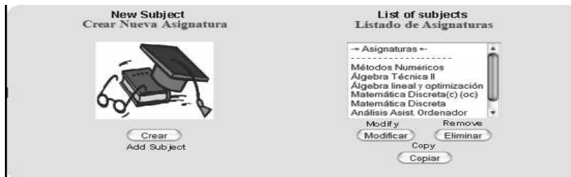
Fig. 4. Subjects menu used by HECACEJ to create new or modify existing subjects.