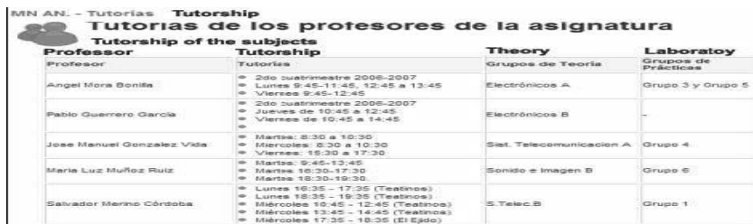
Fig. 3. Tutorships table created by HECACEJ.

By entering in the subjects menu, we will be able to create a new subject or to choose one of those already existent, see Fig. 4. By selecting one of them, we will have a blackboard where to locate important news related with the subject (evaluation method, suspension of classes, schedule modification, practical classes, etc.). After it, we can give the description of all the aspects of the subject with an uniform format: program and class notes, professors, exams, presentations, available questionnaires, problems, practical classes, suggested bibliography (see Figure 5).